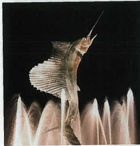
Previous page: Stuart was named the "Most Beautiful Small Town in America" in 2008 by the non-profit America in Bloom.