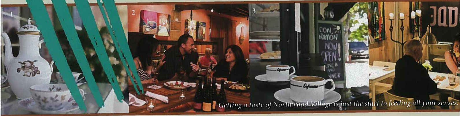
Getting a taste of Northwood Village is just the start to feeding all your senses.

Savvy dining patrons will discover a diverse cultural offering of restaurant fare in Northwood Village. In a place where style and taste are completely individualistic, even the most persnickety of epicureans will satisfy their taste buds here. Once your palate is pleased – and it will be – venture out to the local shops, galleries and salons in the district to tantalize all your other senses. Fabrics and facials to feel, music and conversation to hear, coffee and candles to smell, art and antiques to see. Above all, in Northwood Village, you'll experience real faces and real places that give you the greatest sense of all – the heart warmth that comes from genuine passion.